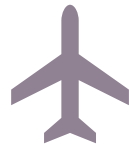
Airplane (City of Derry Airport)